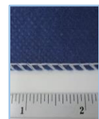
Competitor 1: Only 4-5 stitches per inch.